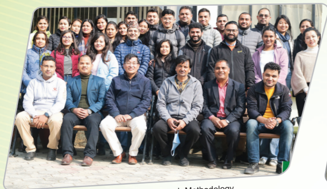
DAVians Workshop on Research Methodology