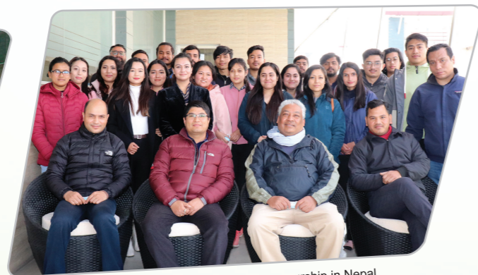
Expert session on prospects of entrepreneurship in Nepal