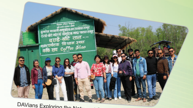
DAVians Exploring the Nature at Sauraha, Chitwan