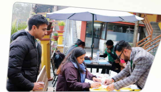
DAVians Engagement on Live Project