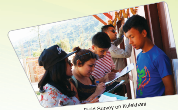
Field Survey on Kulekhani

We provide an opportunity-rich environment where students can determine the path to explore their abilities and determine their outcome. Our role is to assist them in their journey.