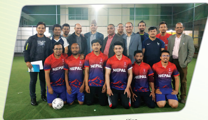
Inter-Semester Futsal Competition