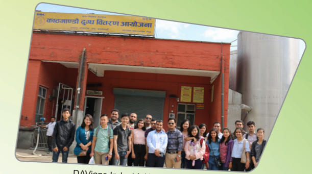
DAVians Industrial Visit (DDC)